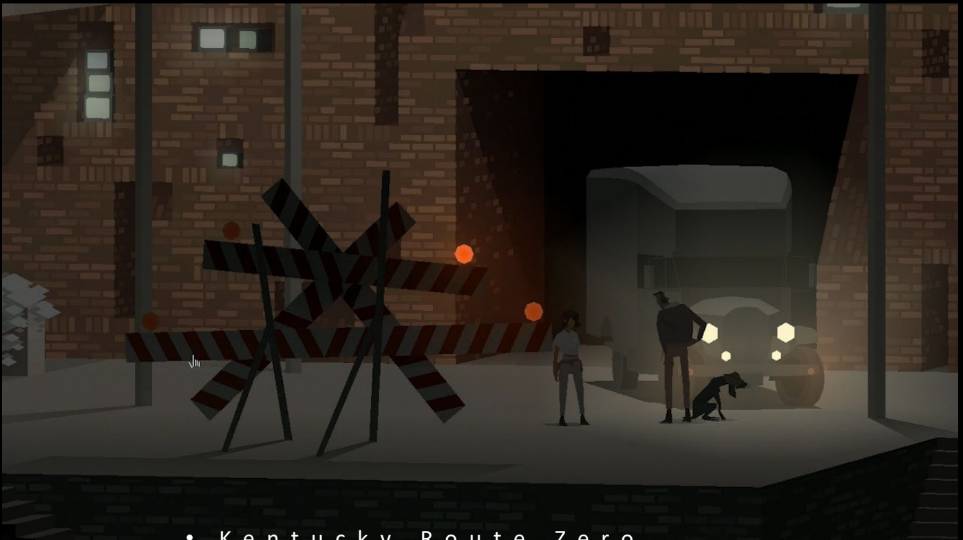
• Kentucky Route Zero